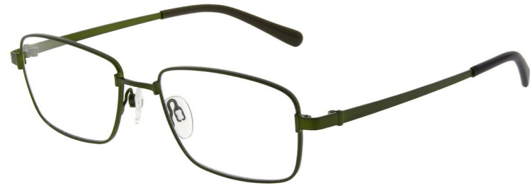
ST3003 Olive 524