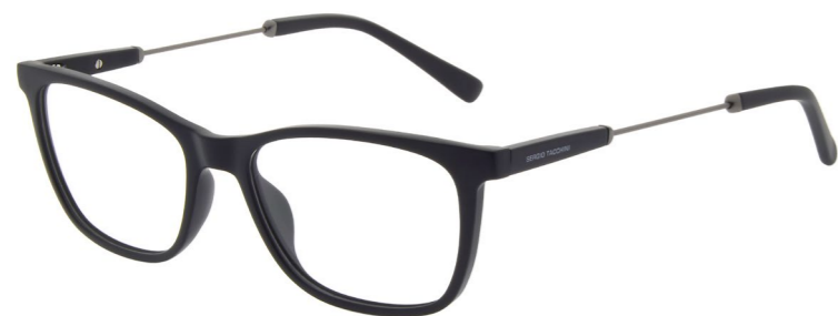
ST1002 Black 002 52/17-145