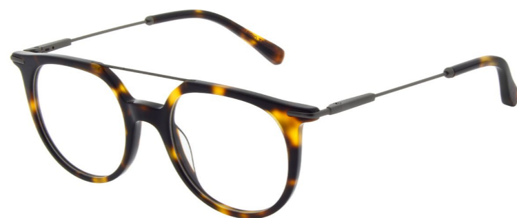
ST1013 Tortoise 403 50/20-140