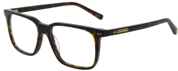
ST1020 Tortoise 403 55/16-140