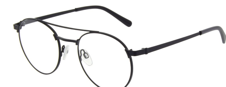
ST3002 Black 050 52/21-140