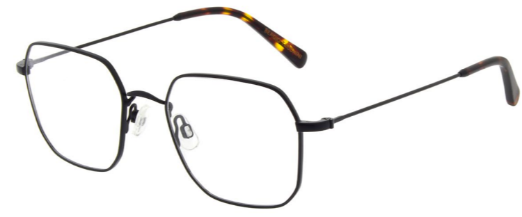
ST3010 Black 005 51/19-145