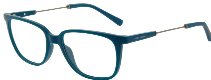
ST1003 Green 565 53/17-145