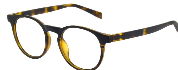
ST1007 Tortoise/Black 400 48/19-145