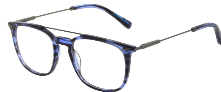
ST1014 Blue 604 53/20-140