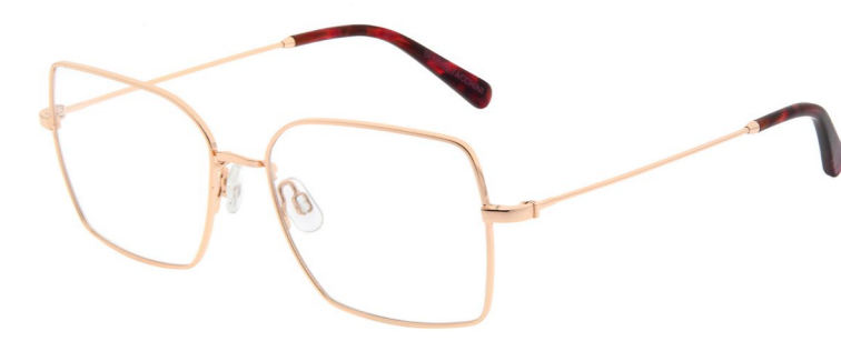
ST3008 Pink gold 489 55/16-145