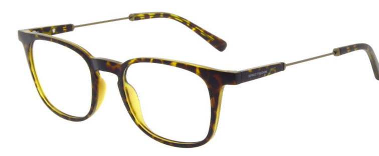
ST1001 Tortoise 404 50/20-145