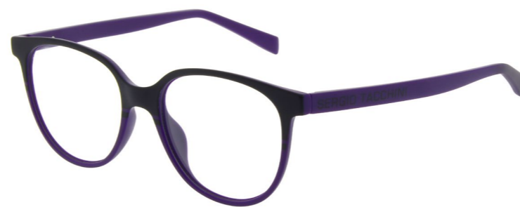
ST1006 Purple/Black 027 53/17-145