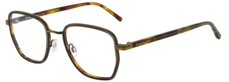
ST1022 Tortoise 401 52/21-145