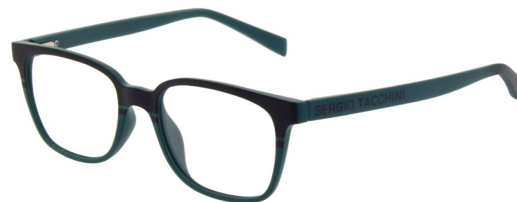
ST1008 Green/Black 500 52/18-145