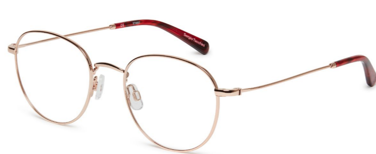
ST3007 Pink gold 489 51/21-145