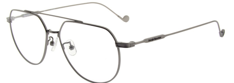
ST3013 Gunmetal 900 55/15-145