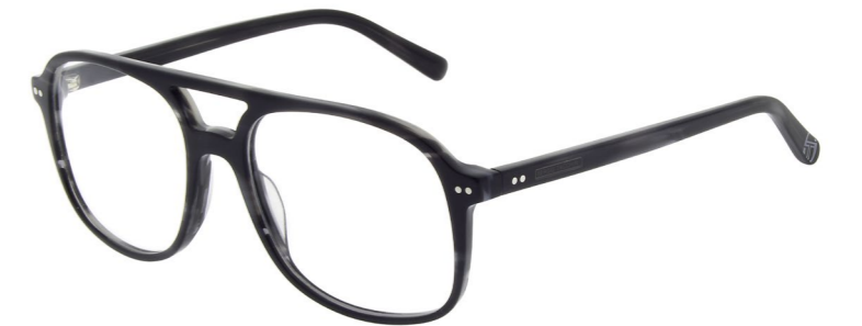
ST1011 black/grey 006 56/18-140