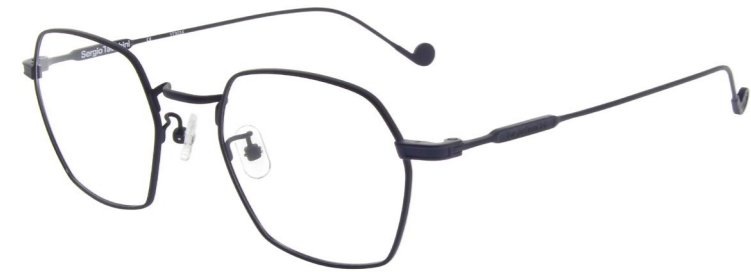
ST3014 Navy 689 51/21-145