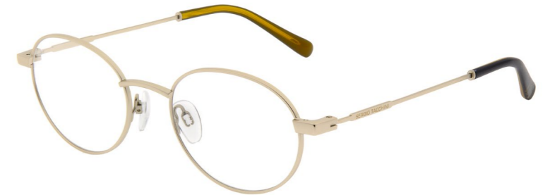
ST3006 Gold 496