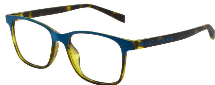
ST1005 Tortoise/Navy 414 53/17-145