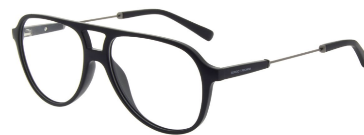
ST1004 Black 002 54/15-145