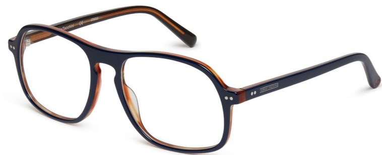
ST1012 Blue 601 55/17-140