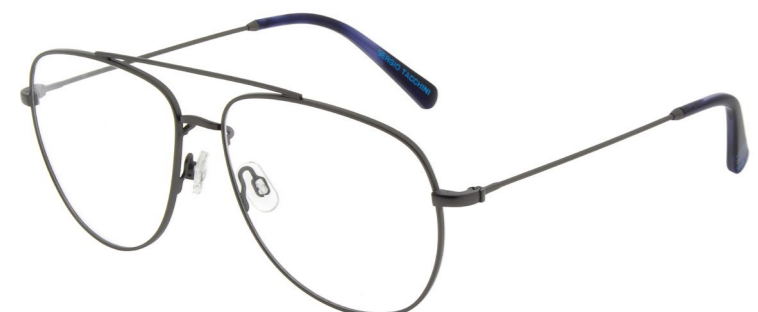
ST3009 Dark Gunmetal 909 59/15-145