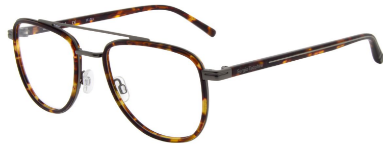
ST1023 Brown Tortoise 429 54/21-145