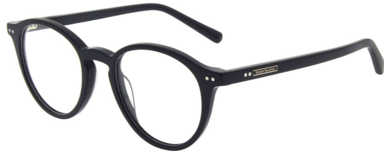
ST1021 Matt Black 002 50/21-140