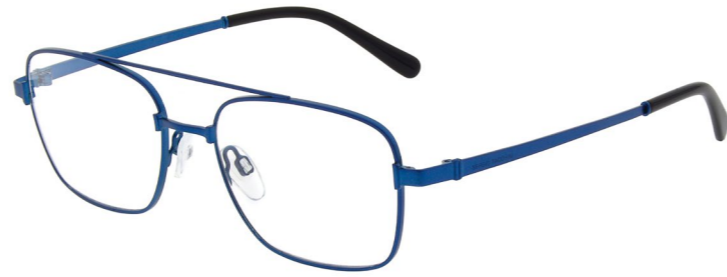
ST3004 Navy 600