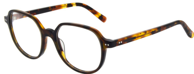
ST1010 Tortoise 401 52/19-140