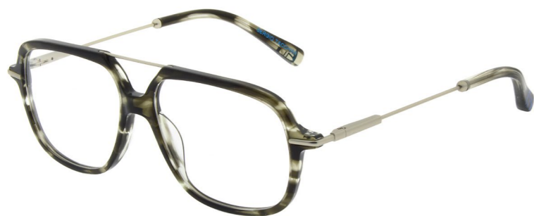
ST1015 Grey 908 55/14-140