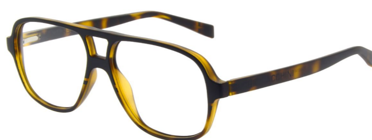
ST1009 Tortoise/Black 400 55/14-145