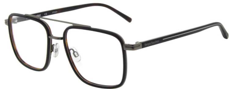
ST1024 Grey 902 55/19-145